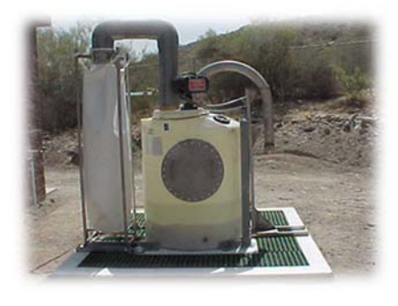
30 Mini-Briners for Remote Well Sites