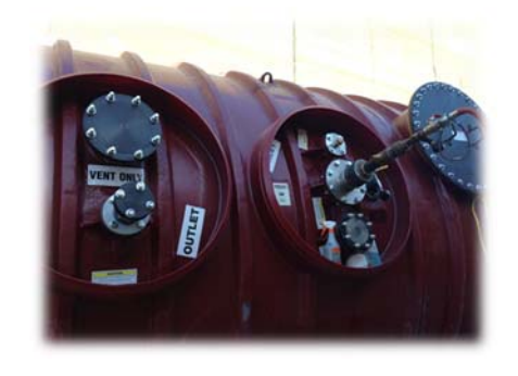
Underground Briner Being Pressure Tested