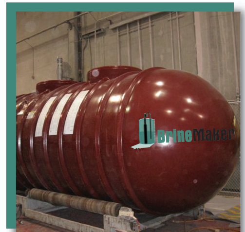
Single & Double Wall

When getting it right the first time is critical, and underground installations always are, you can trust BrineMaker to deliver.