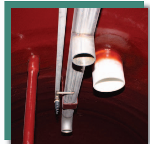
Salt & Water Distribution Headers