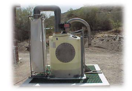
Underground Briner Being Pressure Tested