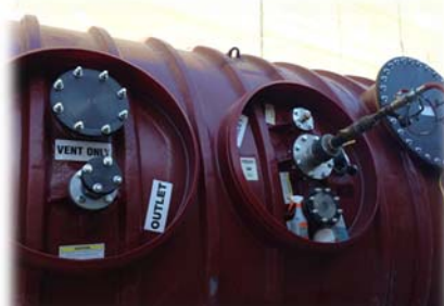
Underground Briner Being Pressure Tested