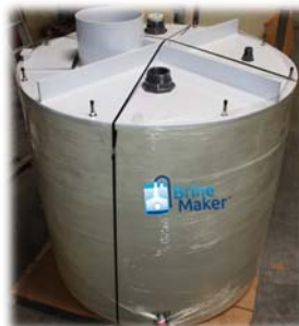
One Ton Briner